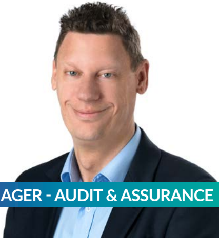
MANAGER - AUDIT & ASSURANCE