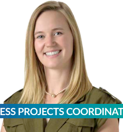
BUSINESS PROJECTS COORDINATOR