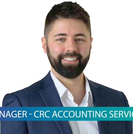
MANAGER - CRC ACCOUNTING SERVICES