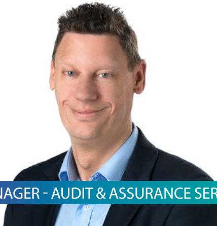
MANAGER - AUDIT & ASSURANCE SERVICES

Registered Company Auditor · Approved External Examiner (Law Society of South Australia) · CPA · Bachelor of Commerce · Advanced Diploma of Accounting