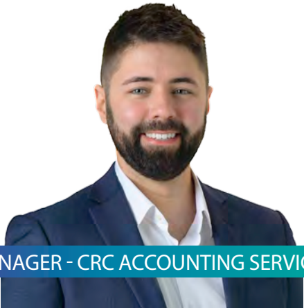
MANAGER - CRC ACCOUNTING SERVICES