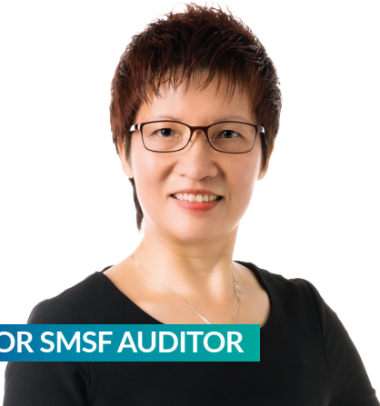
SENIOR SMSF AUDITOR